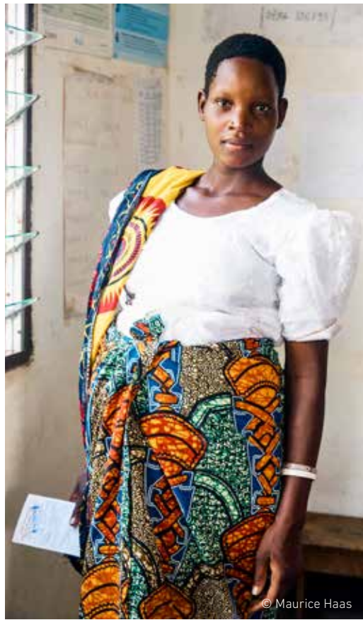
Photo on the right After the blood test, all the results are noted in her personal booklet.

One should do the one and not stop doing the other. It is true, of course: 40 to 70 percent of children in Lugala have growth disorders because they suffer from parasites and worms which cause anaemia. On the other hand, diabetes and high blood pressure cause up to 15 percent of all deaths among people between the ages of 40 and 50, this is significant. And the tendency is rising. In Switzerland, one doesn't really die from these diseases at this age. ■